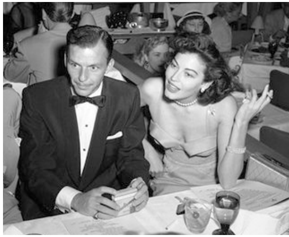
With Ava Gardner

His first "theme" album of popular romantic ballads was released in mid-1946; concert tours and more movies finished out the '40s. Meanwhile on the home front his open affair with